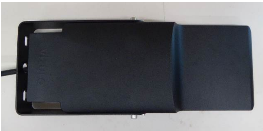
Figs. 1 and 2 – Front side and top side of Micro Martin