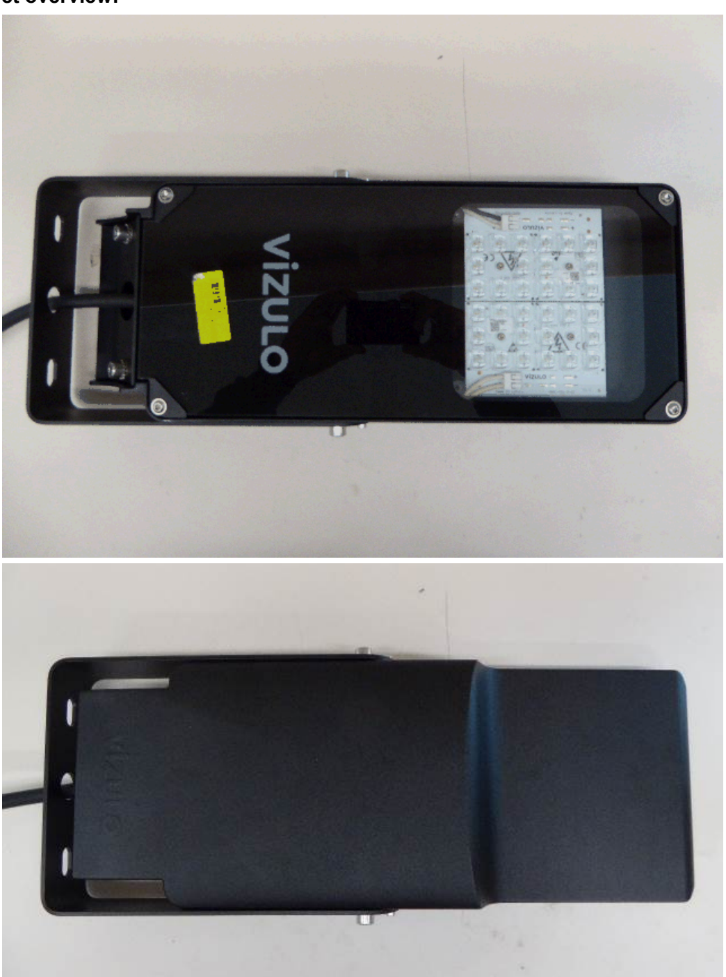
Figs. 1 and 2 – Front side and top side of Micro Martin street lighting luminaire