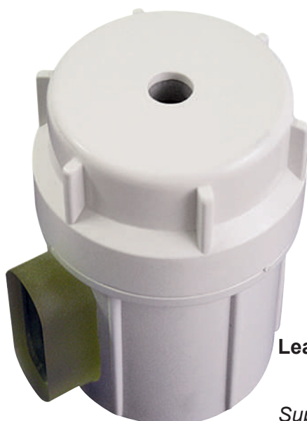
Lead shield for eluate vial