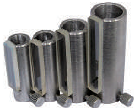
tungsten shields for syringes