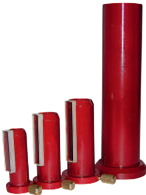
lead shields for syringes