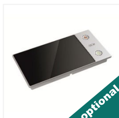
Touch Screen foot-end bed