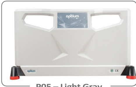
P05 – Light Gray