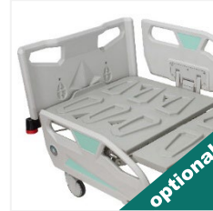
X-Ray Cassette Holder At Backrest with