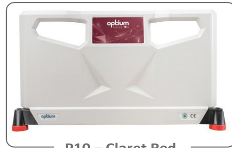
P10 – Claret Red