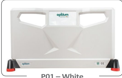
P01 – White