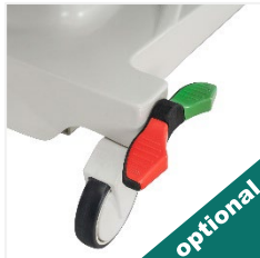
Central Brake Castors 150 mm