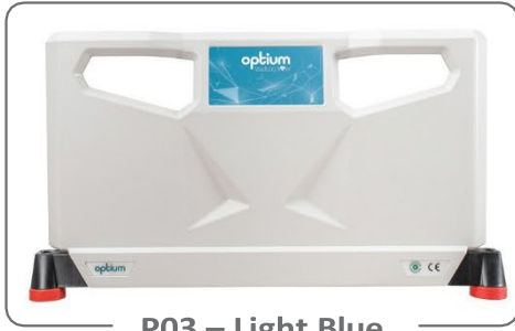
P03 – Light Blue