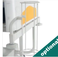
Oxygen Cylinder Holder