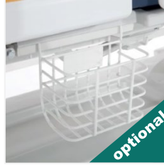
Urine Bag Basket