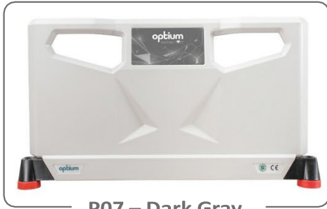
P07 – Dark Gray