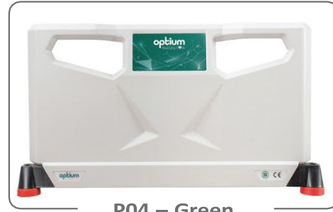
P04 – Green