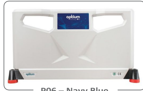
P06 – Navy Blue