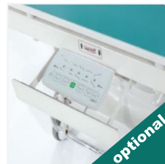
Nurse Panel Shelf