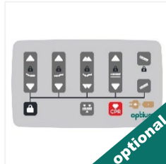
Foot-end Nurse Control Panel