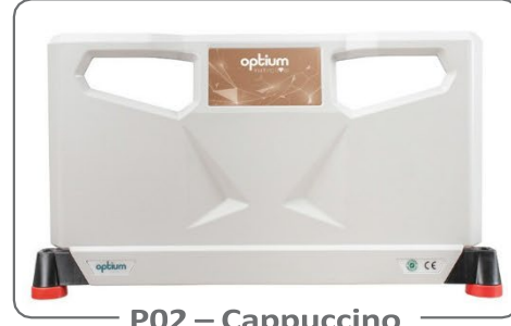
P02 – Cappuccino