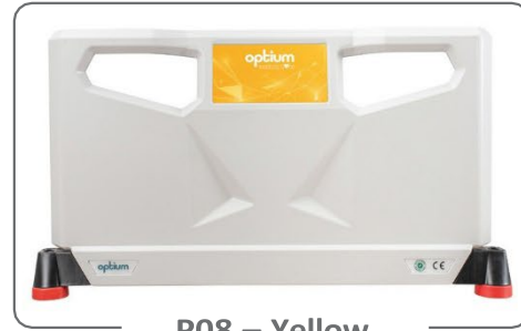
P08 – Yellow