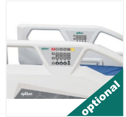
Control Panels Embedded on Side Rails