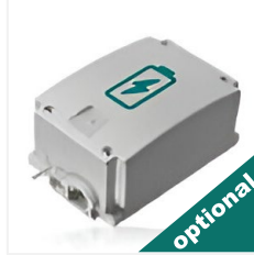
Rechargeable Battery Backup