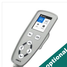
Weight Scale System