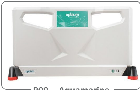
P09 – Aquamarine