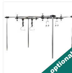
Orthopedic Traction System