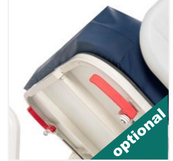
Dual Sided Manual CPR at Backrest