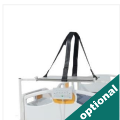
Monitor & Defibrillator Shelf