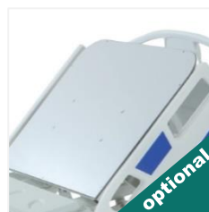
X-Ray Translucent Backrest with Cassette Holder