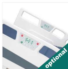
Control Panels Embedded on Side Rails