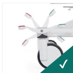
Central Brake Castors 150 mm