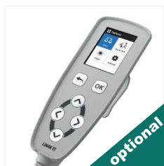
Weighing Scale System