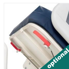
Dual Sided Manual CPR at Backrest