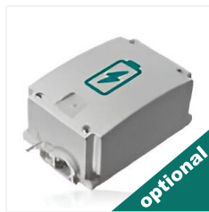
Rechargeable Battery Backup