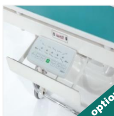
Nurse Panel Shelf