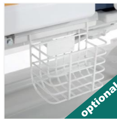
Urine Bag Basket