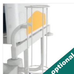
Oxygen Cylinder Holder