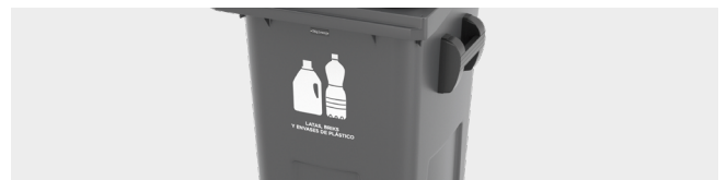
CUSTOMISATION BY THERMAL TRANSFER GRAPHIC