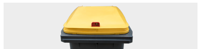
RED DOME LOCK (gravity/non gravity)