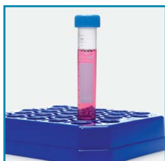
Unique designed tube compartments hold the tube in their position firmly.