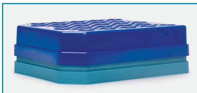
Racks are easily stackable when empty for reducing storage space.