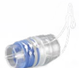
Latex cap with release thread