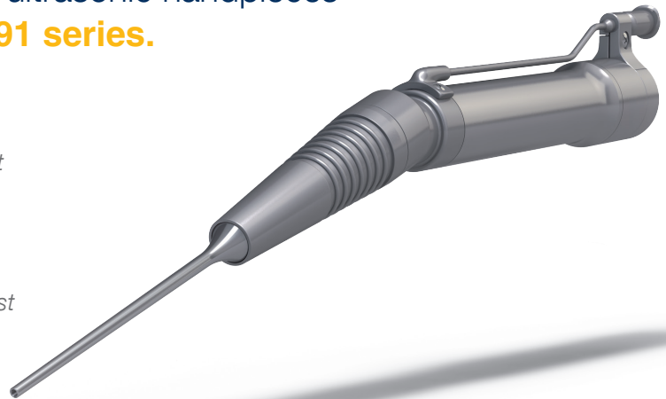
91-020 Micro-handpiece, short, angled