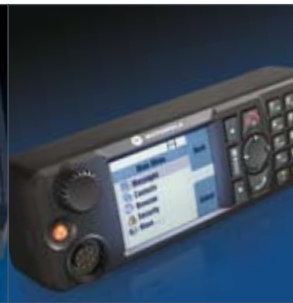
Remote head configuration