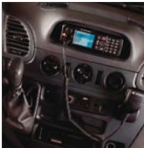
Vehicle dashboard configuration

Usability is enhanced by allowing control of the radio via external devices such as the control box next to the handgrip - simplifying common tasks such as talkgroup and volume level changes.