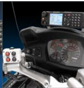
Weather Resistant 'Motorcycle' model