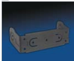
Trunion Mounting Brackets