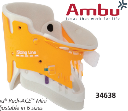
Ambu® REDI-ACE™ Mini is adjustable in 6 sizes