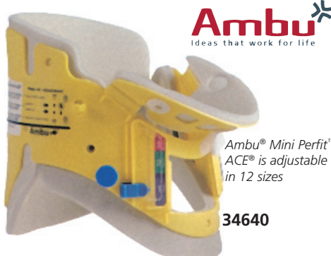
Ambu® Mini Perfit™ ACE® is adjustable in 12 sizes