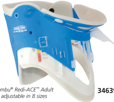
Ambu® REDI-ACE™ Adult is adjustable in 8 sizes