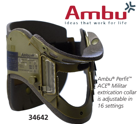
Ambu® Perfit™ ACE® Militar extrication collar is adjustable in 16 settings

Designed to assist with the maintenance of neutral alignment, prevention of lateral sway and anterior-posterior flexion and extension of the cervical spine during transport.