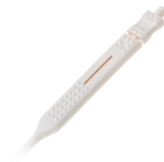
Ergonomical handle with defined breaking point