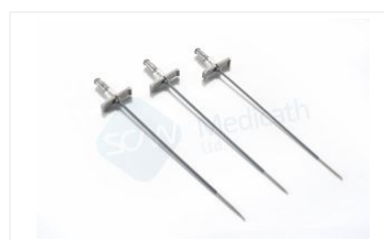
Peelable Introducer Sets