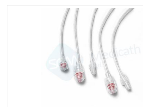
High Pressure Tubing