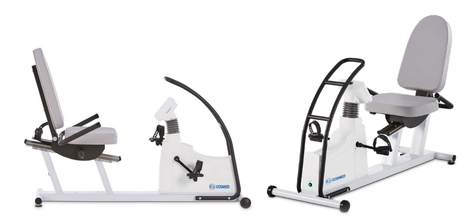
A sturdy support bracket made of tubular steel gives patients a secure hold while moving on and off the E600 ergometer.

E600 Recumbent cyclergometer designed for patient weight of up to 300 kg, it is Ideal for morbidly obese, elderly or handicapped patients. Details such as the 3-way adjustable backrest, special pedal shoes with adjustable pedal spacing and additional cushions that increase the distance between the pedal axis and the large seat surface enable optimal adjustment to every individual patient.