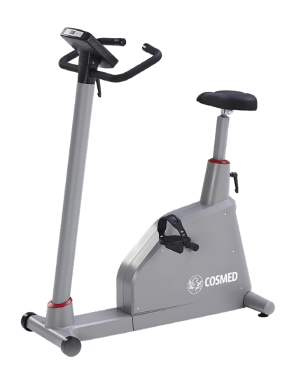
The Optibike Plus ergometer offers a wide range of expansion options.

Our optibike ergometers are also well suited for orthopedic patients thanks to their low step-through access.