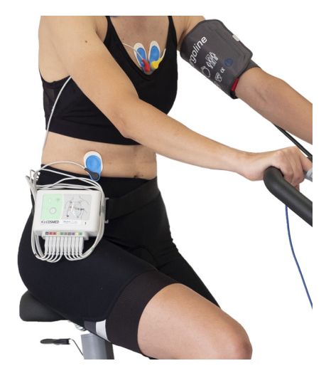
Full interface with COSMED Stress ECG.