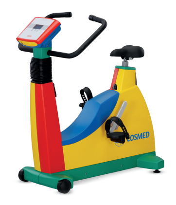
The colorful design of E150 Pediatric relieves children of their fear of the "medical device".