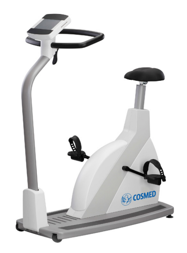
The modular design of the medical-grade ergometer incorporates state-of-the-art technology.

E150 Pediatric The colorful design of the ergometer relieves children of their fear of the "medical device". Special adaptations (extended handlebar, adjustable pedal cranks) make it possible to conduct exercise tests with younger children. In just a few simple steps, the pediatric saddle can be exchanged for a standard saddle. The ergometer can thus also be used with older adolescents and adults.