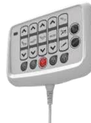
Nurse Control Panel

Control units pictures are representative.