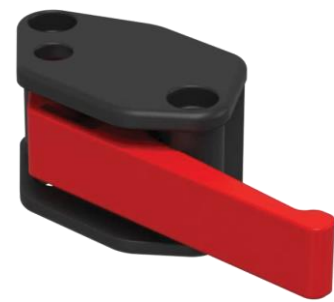
Manual CPR Arm