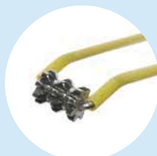
Spike Roller Electrode