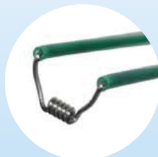
Kriloktrode Electrode (Simultaneous Cutting & Vaporization)