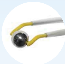
Sphere Electrode (5mm Ball)