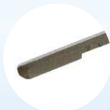
Cold Knife Electrode