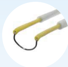
Cutting Loop for 30° Optic