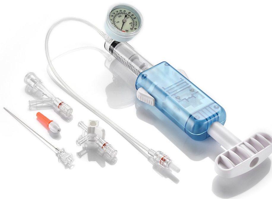
Balloon Inflation Device BID1 Type