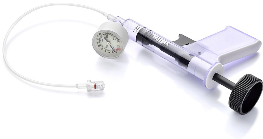
Balloon Inflation Device BID2 type

What else do you want to know? Contact us right now!