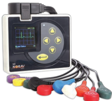
Holter ECG Recorder