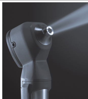
LED-Ring Technology, with 6 LED