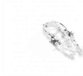
Disposable Pressure Transducers