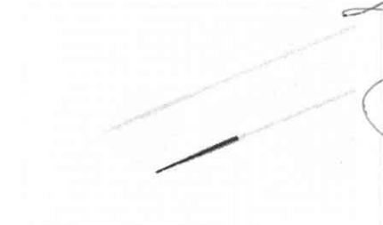
Transradial Introducer Sets