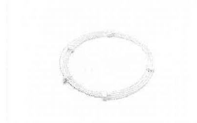
PTCA Guide Wires