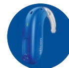
C047 Cool Blue