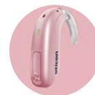
C079 Baby Pink