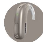
C090 Chroma Beige