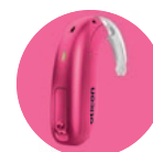
C057 Power Pink