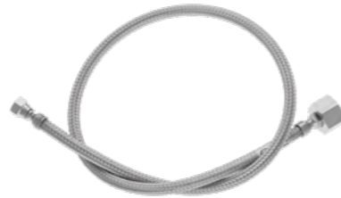
CO 2 High Pressure Tube 300-902-003