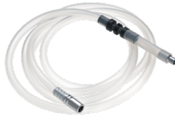
Silicone Tube (only Heater-Version) 300-902-004