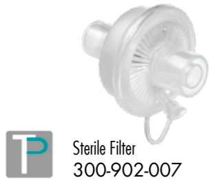
T Sterile Filter 300-902-007