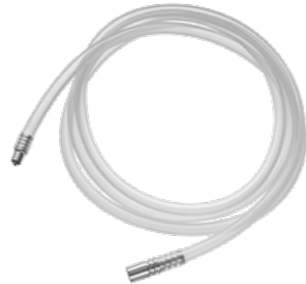
Standard Silicone Tube 300-902-005