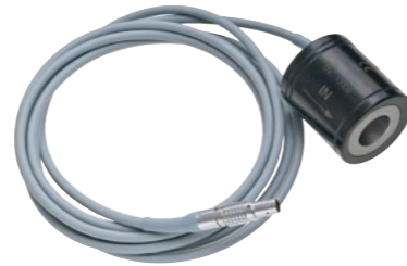
Gas heater with tube (only Heater-Version) 300-902-001