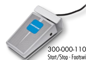
300-000-110 Start/Stop - Footswitch