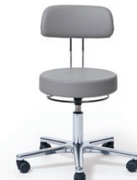
WORK CHAIR 40 - 52 cm. Item code 3018105 5-star base polished, small backrest height adjustable, sitting cushion Ø 36 cm, cover in compact „Stone“ C214, 360° manual ring release, safety castors.