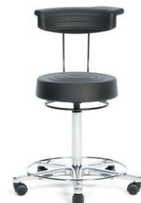
WORK CHAIR 54 - 73 cm. Item code 4019105 Chromed foot ring, full foam sitting cushion and crescent-shaped backrest, „Black“, 360° manual ring release, safety castors.