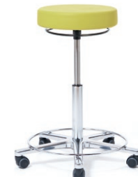
WORK STOOL 54 - 73 cm. Item code 3009105 Chromed foot ring, sitting cushion Ø 36 cm, cover in compact „Citron“ C500, 360° manual ring release, safety castors.