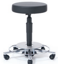
WORK STOOL 51 - 71 cm. Item code 4105305 EL 11 Foot release, sitting cushion Ø 40 cm, cover „Black“ EL 11, gas spring column and safety castors overall electrically conductive.