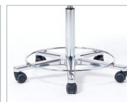
Manual ring release, foot ring