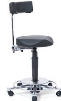
WORK CHAIR 51 - 71 cm. Item code 4185305 EL 11 Foot release, swivelling crescent-shaped backrest height adjustable, anatomically shaped seat edge Ø 40 cm, cover „Black“ EL 11, gas spring column and safety castors overall electrically conductive.