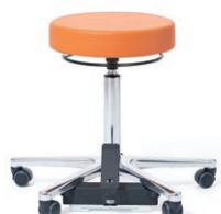
WORK STOOL 46 - 58 cm. Item code 3008205 CENTRAL 5-star base polished with central arrest, sitting cushion Ø 36 cm, cover in compact „Orange“ C530, 360° manual ring release.