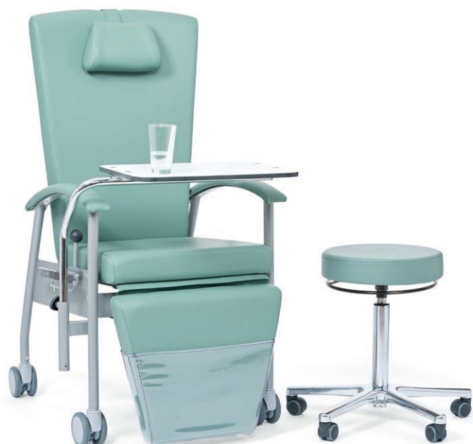
Versatile work stool that suits every treatment chair

Sit like a pro so you can work like a pro. Anatomy, ergonomics and functionality characterise the product design of GREINER's work stools and chairs. Modern sitting comfort not only stands for comfortable upholstery and backrests or smooth-running castors – every functional detail also contributes to an active and ergonomic sitting position.