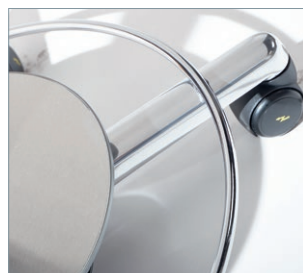
Foot release with foot ring