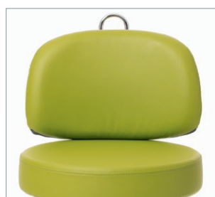
Large backrest front face