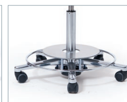
Foot release with foot ring