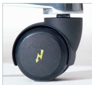
Electrically conductive safety castors, EL 11