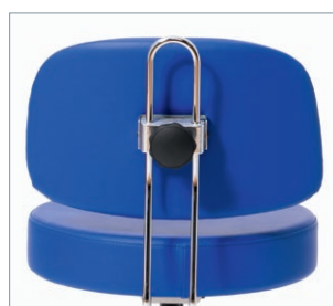
Large backrest from the rear