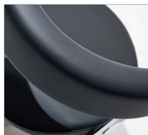
"Black" conductive cover, EL 11