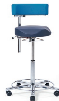
WORK CHAIR 54 - 73 cm. Item code 4185105 PREMIUM AS Chromed foot ring, swivelling crescent-shaped backrest height adjustable, anatomically shaped seat edge Ø 40 cm, cover in premium „Navy“ + „Aqua“ P710/700, manual height adjustment, safety castors.