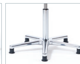
5-star base with sliders