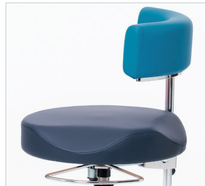
Fatigue-free operation thanks to support for arms or torso