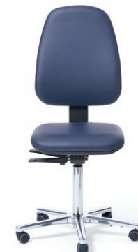
OFFICE CHAIR 54 - 73 cm. Item code 3054600 PREMIUM BS 5-star base polished, backrest adjustable in height and depth with dumping function, without armrest, cover in premium „Navy“ P710, safety castors.