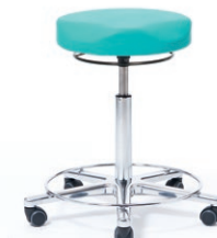
WORK STOOL 54 - 73 cm. Item code 4109105 Chromed foot ring, anatomically shaped seat edge Ø 40 cm, cover in compact „Cyan“ C422, 360° manual ring release, safety castors.