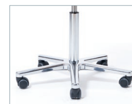
Manual ring release, 5-star base

This is what free choice looks like: The base parts of the GREINER work stools and chairs are characterised by their glossy design, quality and seating comfort. Otherwise, they are rather versatile and tailored to your needs. The foot release developed by GREINER, for example, offers high clinical added value wherever sterile or contaminated gloves are used. Triggered by the round pedal plate attached above the 5-star base, it can be operated "hands-free" all around. All work stools have safety castors, on request as an electrically conductive version.