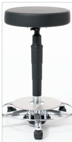
Surgery-compliant equipment EL 11 with electrical conductivity