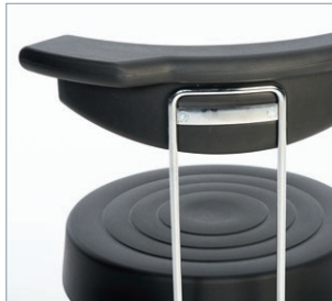
Modern design with high functionality