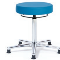
WORK STOOL 54 - 73 cm. Item code 4108305 RG 01 PREMIUM HO 5-star base polished with sliders, sitting cushion Ø 40 cm, cover in premium „Aqua“ P700, 360° manual ring release.