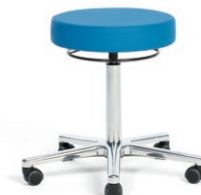
WORK STOOL 40 - 52 cm. Item code 4108105 PREMIUM HO 5-star base polished, sitting cushion Ø 40 cm, cover in premium „Aqua“ P700, 360° manual ring release, safety castors.