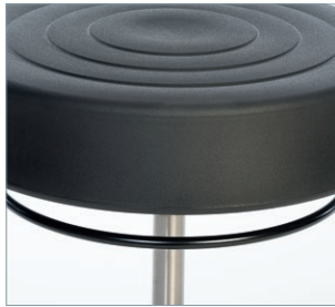
NexGen design and manual ring release