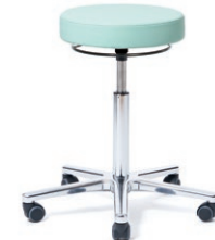
WORK STOOL 54 - 73 cm. Item code 3008305 5-star base polished, sitting cushion Ø 36 cm, cover in compact „Mint“ C450, 360° manual ring release, safety castors.