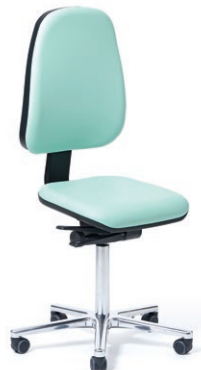
OFFICE CHAIR 54 - 73 cm. Item code 3054600 5-star base polished, backrest adjustable in height and depth with dumping function, without armrest, cover in compact „Mint“ C450, safety castors.