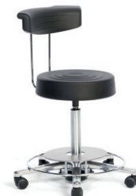
WORK CHAIR 51 - 71 cm. Item code 4015305 Foot release, full foam sitting cushion and crescent-shaped backrest, „Black“, safety castors.