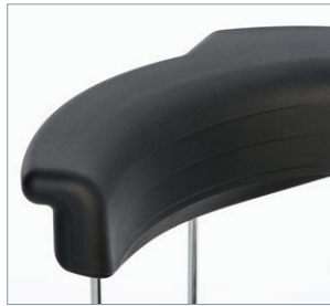
Crescent-shaped full foam backrest