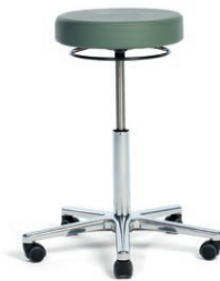
WORK STOOL 54 - 73 cm. Item code 3008305 5-star base polished, sitting cushion Ø 36 cm, cover in compact „Petrol“ C435, 360° manual ring release, safety castors.

Let us offer you some inspiration: Here is a small selection from the GREINER work stools and chairs' product range. Stools without backrest, chairs with backrest in different designs. Height adjustment by hand or foot. Base parts and sitting heights of your choice. Upholstery materials in a wide variety of colours with compact or premium fabric. Or EL 11 equipment that is suitable for surgeries with electrically conductive components. The choice is yours.