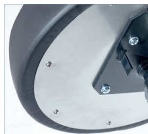
Stainless steel round plate