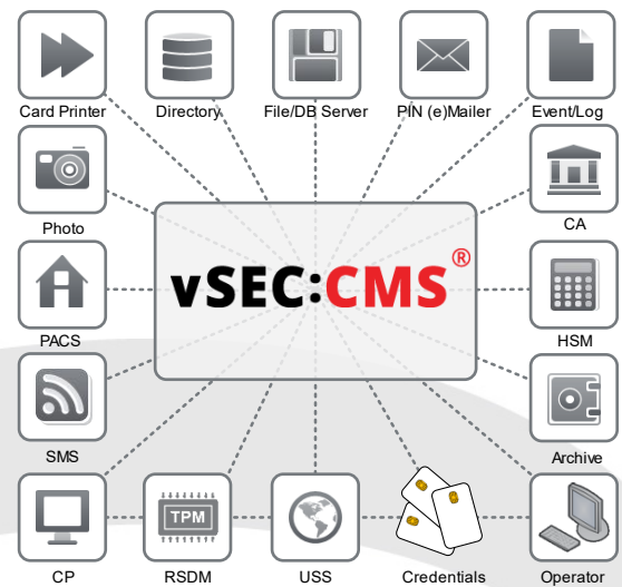
Figure 2: Connections

The vSEC:CMS S-Series is an innovative, easily integrated and cost-effective smart card management system that helps organizations deploy and manage smart cards quickly and efficiently. The vSEC:CMS S-Series is client-server based. It streamlines all aspects of smartcard management by easily connecting to enterprise directories, certificate authorities, smart card printers, external databases, physical access control systems, and more. The S-Series is designed for several operators and users working in parallel without a need for synchronization; each operator requires access to the operator application and the operator's operator smart card only.