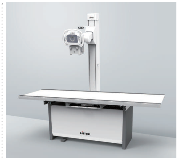
Bucky Table with four way floating top • Foot switch type / Sensor type*