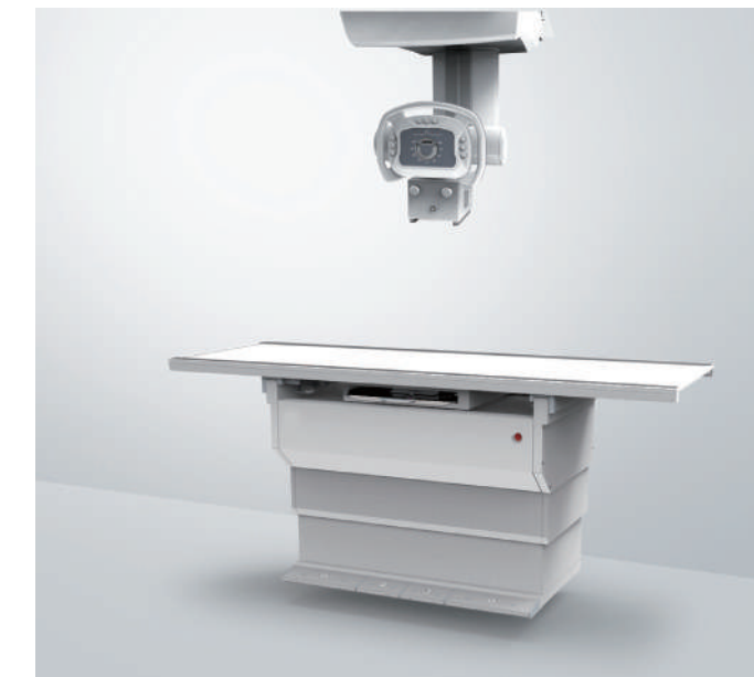
Elevating Bucky Table with four way floating top • High patient load capacity