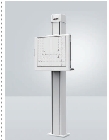
Tilting bucky wall stand*