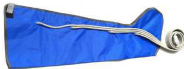
▲ Single leg cuff XL Size 110x38cm