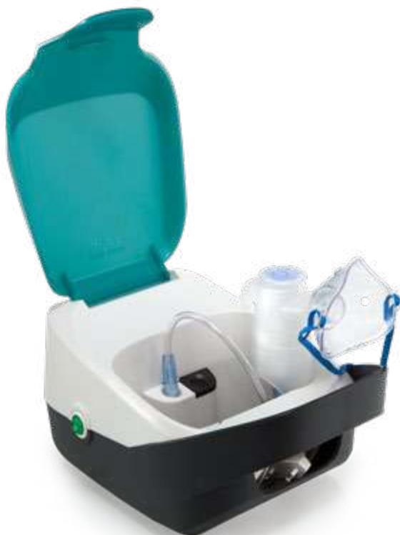
▲ Evolution, p. 6