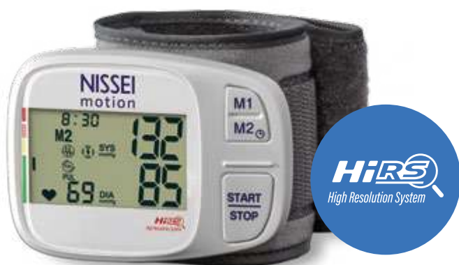
▲ Nissei Motion, p. 24

Nissei Motion is the first wrist type blood pressure monitor combining the gentleness of inflation technology with the superior accuracy of the High Resolution System and M-Shaped Cuff.