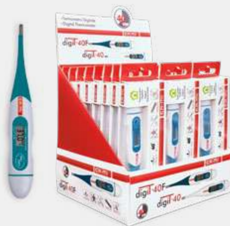
▲ Counter display box for digiT-40 and digiT-40F thermometers, p.17

The large digital display allows for easy reading even for people with vision problems. More over these thermometers, can have multiple uses like measuring the temperature of warm water for baby bath or of infant feed, milk, etc.