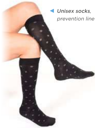
◀ Unisex socks, prevention line

Preventive stockings with graduated compression, for the wellbeing of every legs.