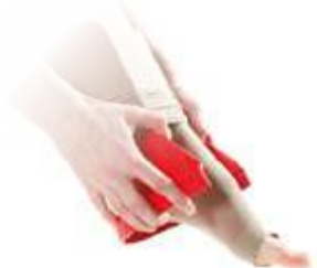
◀ Ezy-as, universal stocking applicator

Kàmila range includes a selection of aids made to improve stockings wearability as well.