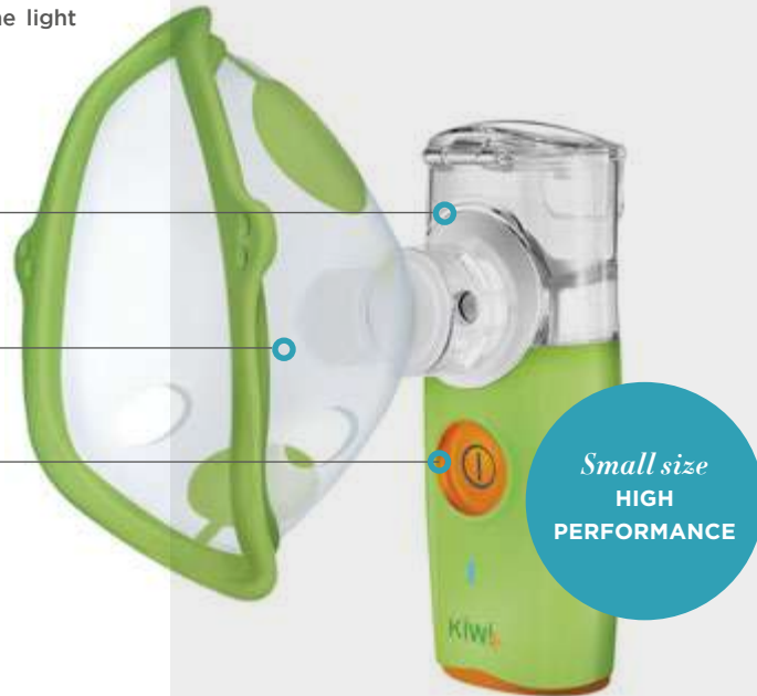
▲ Kiwi+, p. 5

Reduces the risk of annoying clogging of the mesh caused by improper cleaning at the end of each use.