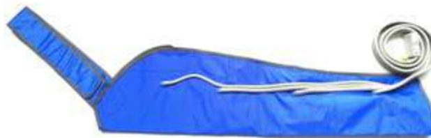
▲ Single Arm cuff Size 70x25cm