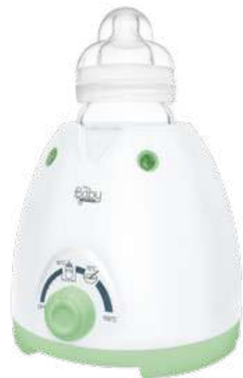
▲ Thermo Baby, p. 60

Every mum wants what's best for her baby from day one. Then it's good to know there is expert advice on hand to help take care of mums and babies during the first stage of their lives. CA-MI products will support the choices of mums in every field of babies' growth, as this company aims to help every mum to make her baby start off on the right foot.