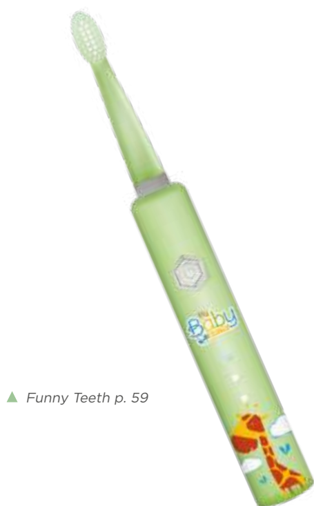
▲ Funny Teeth p. 59

CA-MI products are made only with the best materials to guarantee that every baby is treated with the gentleness and safety they deserve.