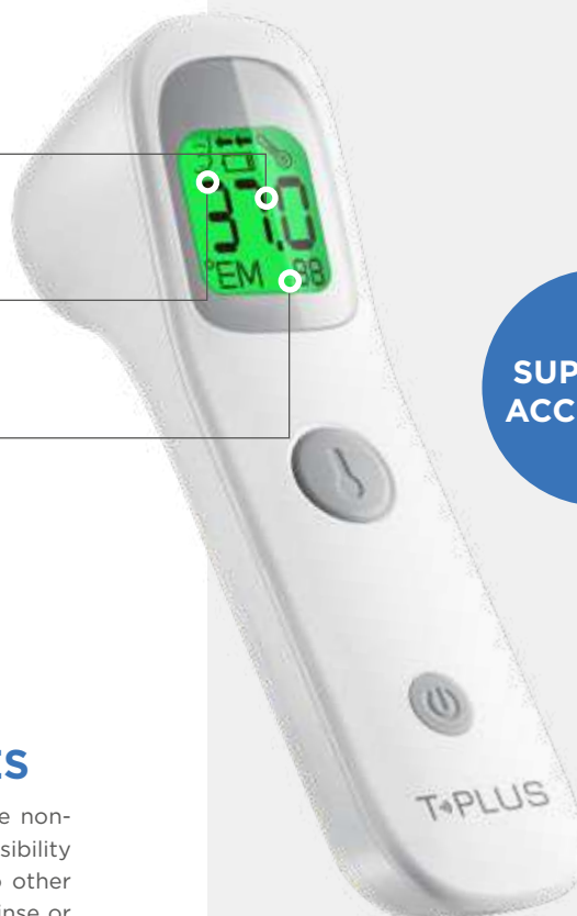
◀ T-Plus, p.16

Reduces the systematic errors caused by environmental temperature transition.