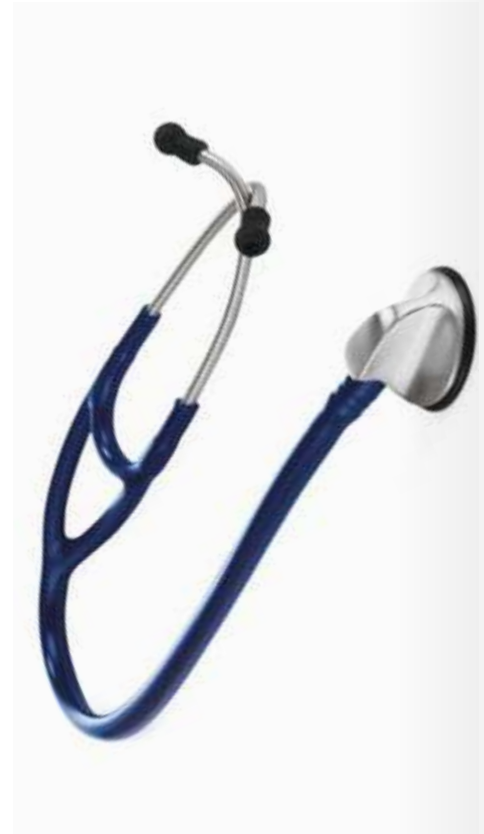
▲ S-100 Cardio, p. 33

CA-MI matches its home-care diagnostic line with a range of product suitable for clinicians of all levels. A selection of devices adequate for practitioners as well as cardiologists who require more accurate and reliable instruments to validate their diagnosis.