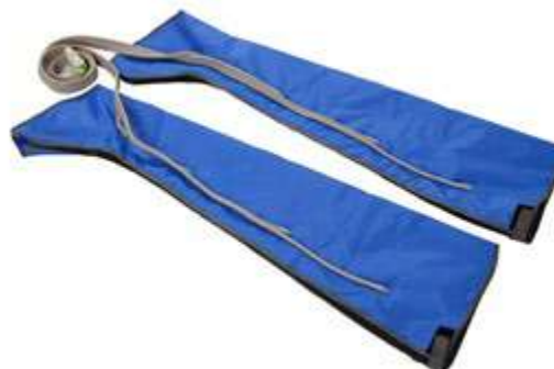
▲ Two legs cuffs Size 110x30cm