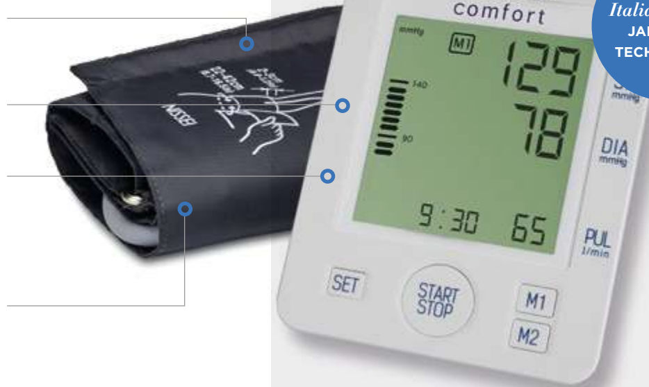
▲ Nissei Comfort, p. 22

Thanks to the inflation technology blood pressure is monitored in a gentler and quicker way during the gradual inflation of the cuff.