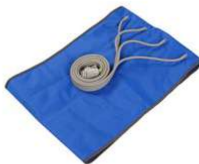
▲ Waist cuff Size 145x40cm