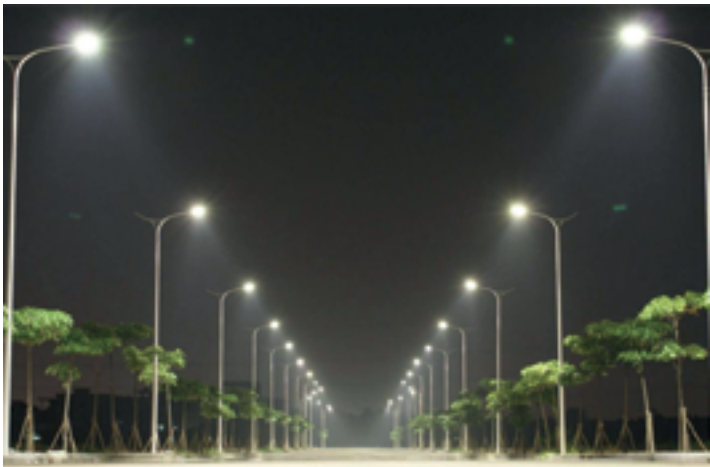
Street LED light Spectra 30W

Spectra LED street light is designed for lighting streets, parking lots, courtyards and other outdoor spaces. The design is similar to a leaf, the luminaires in this series have taken the same name - Spectra.