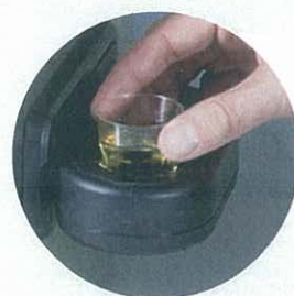
EXTERNAL PROBE (optional for loose liquids inspection - EU Type A)