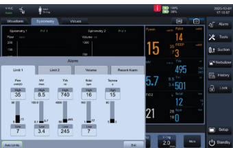
Automatic alarm limit

Benefit from the intuitive UI design of V3, it only takes two steps to adjust ventilation parameters. The functional layout is clinically applicable, and what you think is what you get.