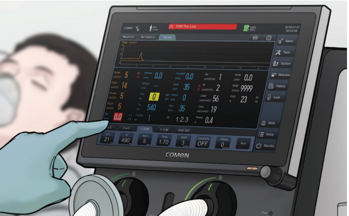
Monitoring —— assessment of respiratory status