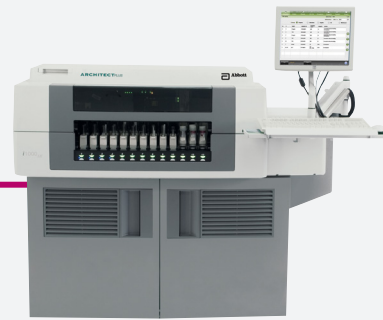
ARCHITECT i1000 SR