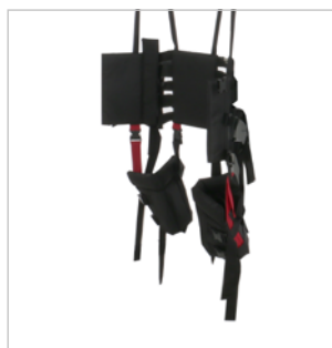
Suspension harness M, XL