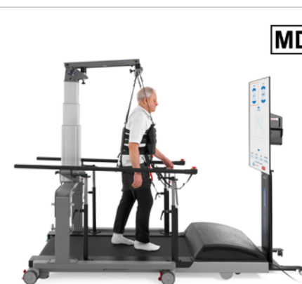
Eleveo + Axelero Gait & Balance