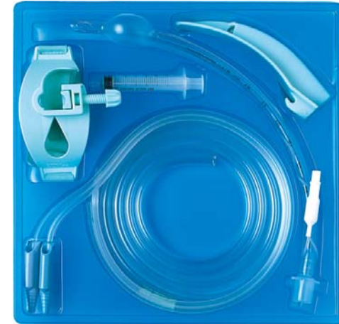
HT-03: Disposable Combined Spinal Epidural Anaesthesia Puncture Kit