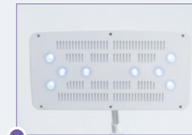
8 Power LED