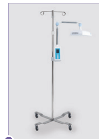
with IV pole