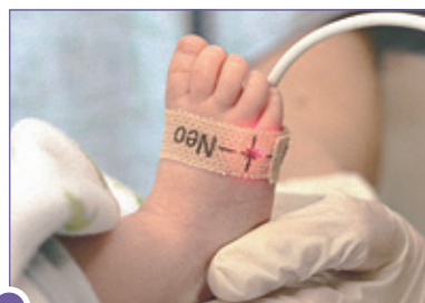
Masimo Pulse oximeter*