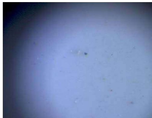
At 1000 th hour