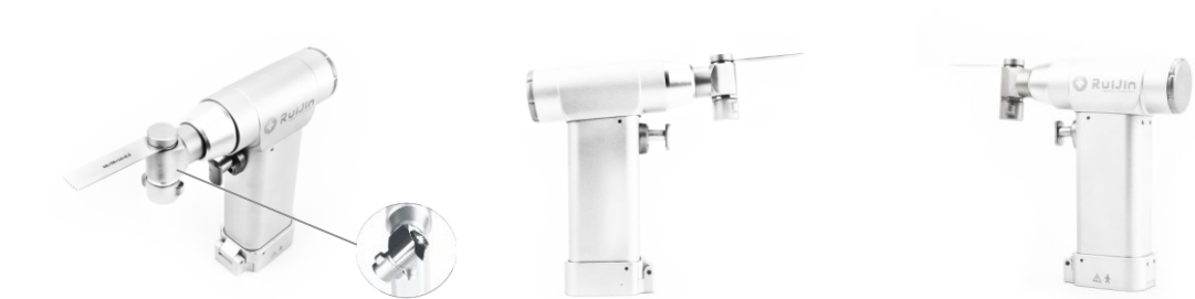
Mini Saw blade