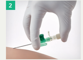
Wings and closing cone