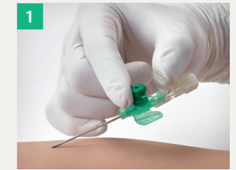
Grip plate and port

Unparalleled flexibility is achieved by offering distinct handling and insertion possibilities for diverse needs, a secure hold and precise control.