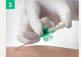
Closing cone and port

Easy to use: No extra steps needed to prepare the catheter for insertion.