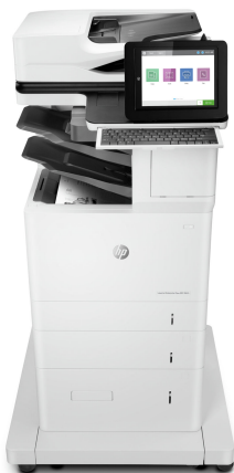
HP LaserJet Enterprise Flow MFP M635z