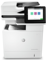
HP LaserJet Enterprise MFP M635h

This HP LaserJet MFP with JetIntelligence combines exceptional performance and energy efficiency with professional-quality documents right when you need them—all while protecting your network from attacks with the industry's deepest security. 1