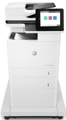
HP LaserJet Enterprise MFP M635ft