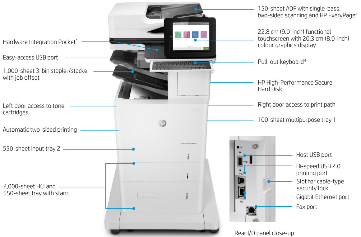
HP LaserJet Enterprise Flow MFP M635z shown