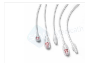
High Pressure Tubing