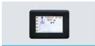
STANDARD TOUCH SCREEN DISPLAY