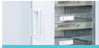
OPTIONAL BLOCK 3XGLASS DOOR