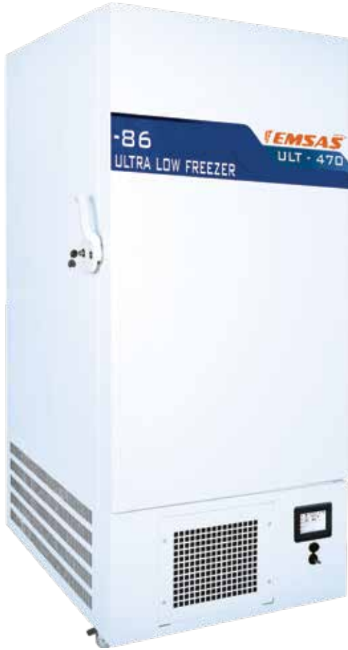
ULT 470 (-50/-86)