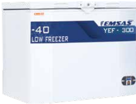
YEF 300 (-20/-40)