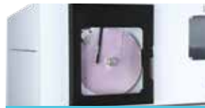
OPTIONAL GRAPHICAL CHART RECORDER