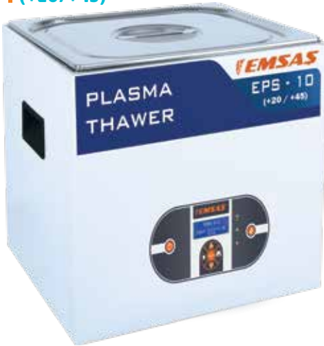
EPS 10 (+20/+45)