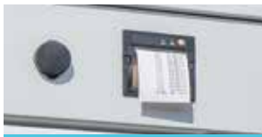
STANDARD THERMAL PRINTER