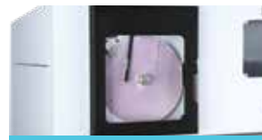
OPTIONAL GRAPHICAL CHART RECORDER