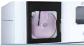
OPTIONAL GRAPHICAL CHART RECORDER