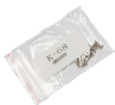
K-68 screw kit