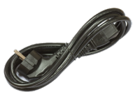
1 IEC cord