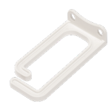
Cable managment brackets