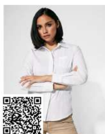
SOFIA L/S CM5161