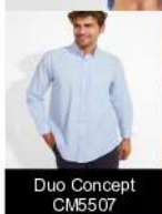
Duo Concept CM5507