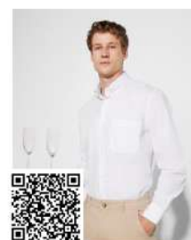
AFOS L/S CM5504