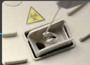
Waterfall probe cleaning