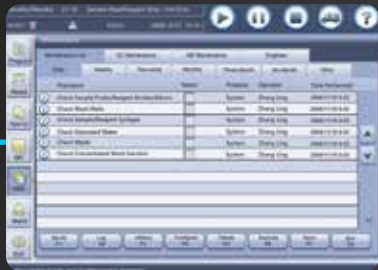
Step-by-step maintenance guide