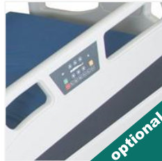
Control Panels Embedded on Side Rails