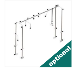
Orthopedic Traction System