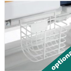
Urine Bag Basket