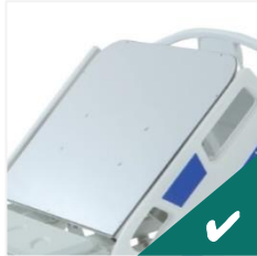
X-Ray Translucent HPL Backrest