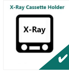
X-Ray Cassette Holder at Backrest