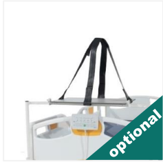
Monitor & Defibrillator Shelf