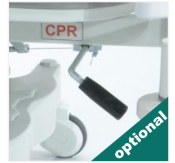
Dual Sided Manual CPR at Backrest