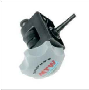
Handel with winding drum