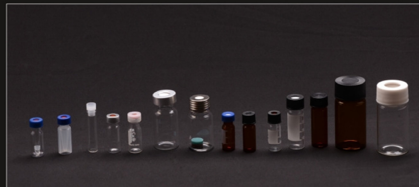
- Sample Bottle