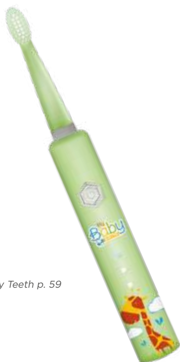
▲ Funny Teeth p. 59

CA-MI products are made only with the best materials to guarantee that every baby is treated with the gentleness and safety they deserve.