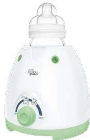
▲ Thermo Baby, p. 60

Every mum wants what's best for her baby from day one. Then it's good to know there is expert advice on hand to help take care of mums and babies during the first stage of their lives. CA-MI products will support the choices of mums in every field of babies' growth, as this company aims to help every mum to make her baby start off on the right foot.