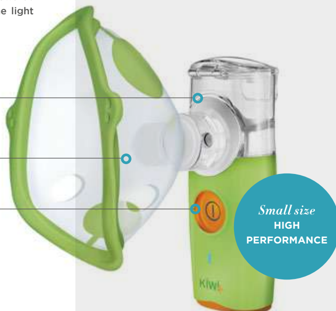
▲ Kiwi+, p. 5

Reduces the risk of annoying clogging of the mesh caused by improper cleaning at the end of each use.