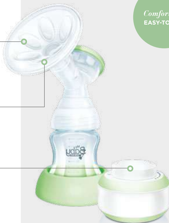
▲ Mamy Milk p.58

Aspiration can be adjusted to respect maternal breast sensibility and guarantee painless milk extraction.