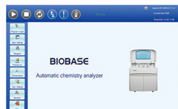
Software User-friendly software.