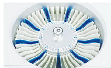
Reagent Tray 2~8°C cooling for 24 hours.