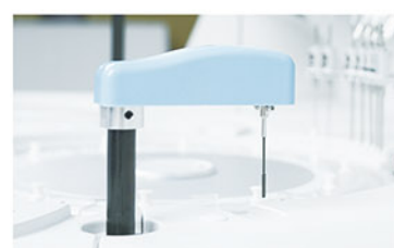
Mixer Probe Teflon coating to avoid cross contamination.