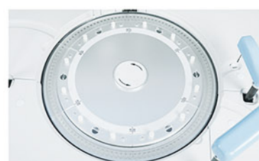
Reaction Tray 37±0.1°C, real-time monitor.