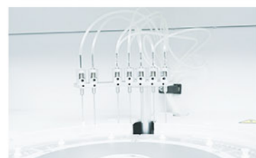
Washing Probe Independent 7-step washing system.