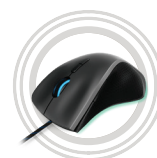
Lenovo Legion M500 RGB Gaming Mouse