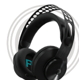
Lenovo Legion H300 Gaming Headset