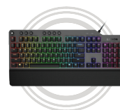
Legion K500 Gaming Keyboard