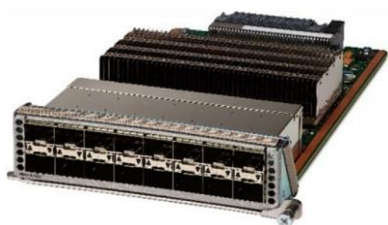
Figure 2. Cisco MDS 9132T 32-Gbps 16-Port fibre channel port expansion module