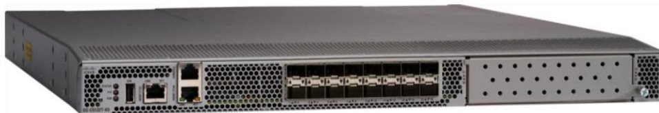
Figure 1. Cisco MDS 9132T 32-Gbps 32-Port fibre channel switch