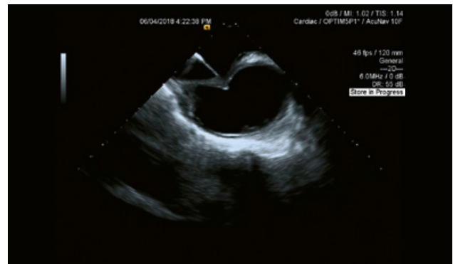
Septal puncture with the new 2D ICE imaging from the ACUSON SC2000 5.1 software and parameters.

By following the steps below, you can create a preset on the ACUSON SC2000 PRIME to easily change to the new 2D ICE imaging option settings: