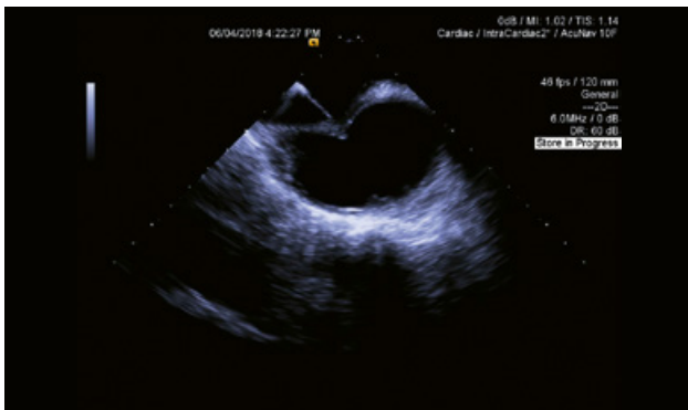
Septal puncture with the current 2D ICE imaging factory presets.

Shown below are the ACUSON SC2000 PRIME 2D ICE imaging software and settings which were designed to enhance structure continuity and improve speckle pattern.